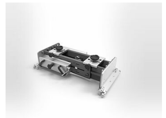
HDSMHFL160-200-F07 jacking beam 16 t, pneumatic