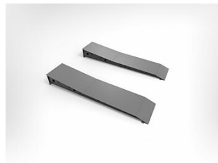
HDSF0713-330 2 ascending ramps, 3300 mm