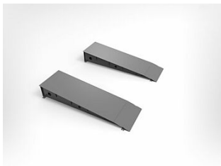
HDSF0713-235 2 ascending ramps, 2350 mm