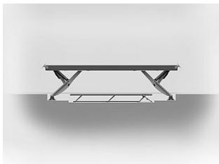
HDSF07BA-XXXXX floor levelling for pits of platforms