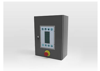
HDSF07-SK01 2. control box in the washing area