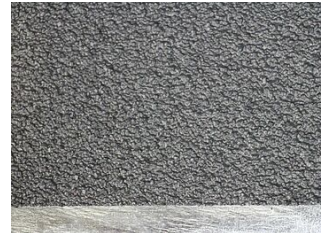
HDSF07-AS0X anti-skid surface anti-skid class R13