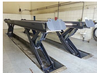
HDSF07DUROPLEX-XX Special coating in addition to galvanizing