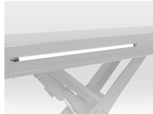
HDSF07-BL-LEDXX Set with 4 to 10 LED lamps