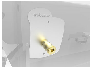
HDSF07-DL02 Pneumatic sockets