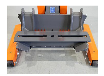
EHB907TRT412TR01 Basic cross beam 880 mm, tractor support at front