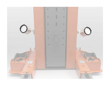
EHB907SPOT02 2 LED spots